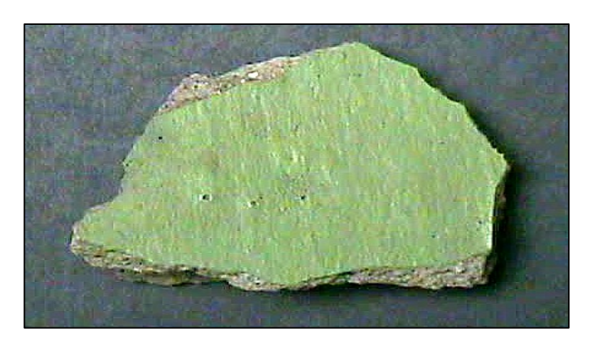
Material Coated with Lead-Based Paint

• Paint that contains 5,000 parts per million lead or greater.