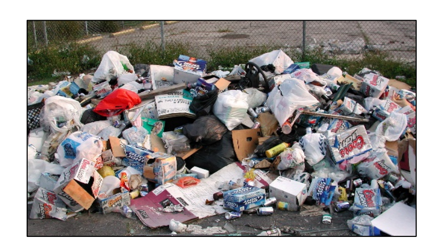
Bricks Municipal Trash

Loose metal pieces, such as metal posts or beams, are unacceptable. However, rebar contained within concrete is acceptable.