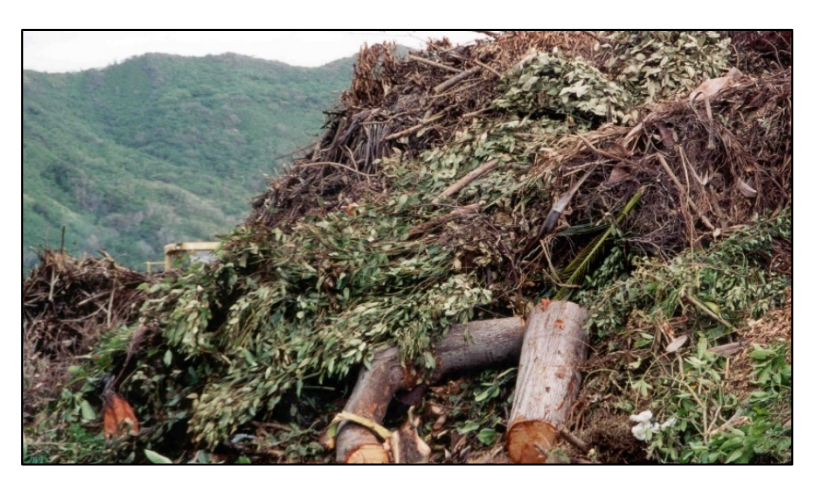
Green Waste and Soil