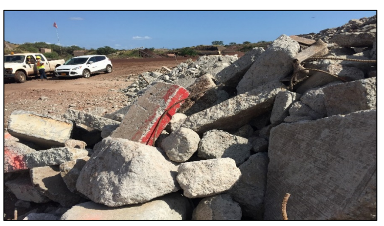
Painted Concrete and Asphalt