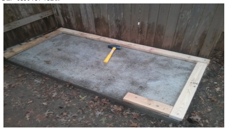
Pesticide Contaminated Materials

Includes, but not limited to, concrete slabs poured prior to 1980.